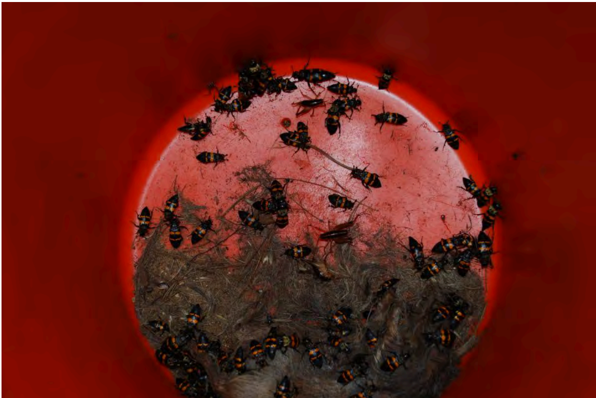
Figure 2. The remains of a large laboratory rat (after two weeks) placed as bait in a five gallon bucket along with the nightly catch of Nicrophorus beetles.