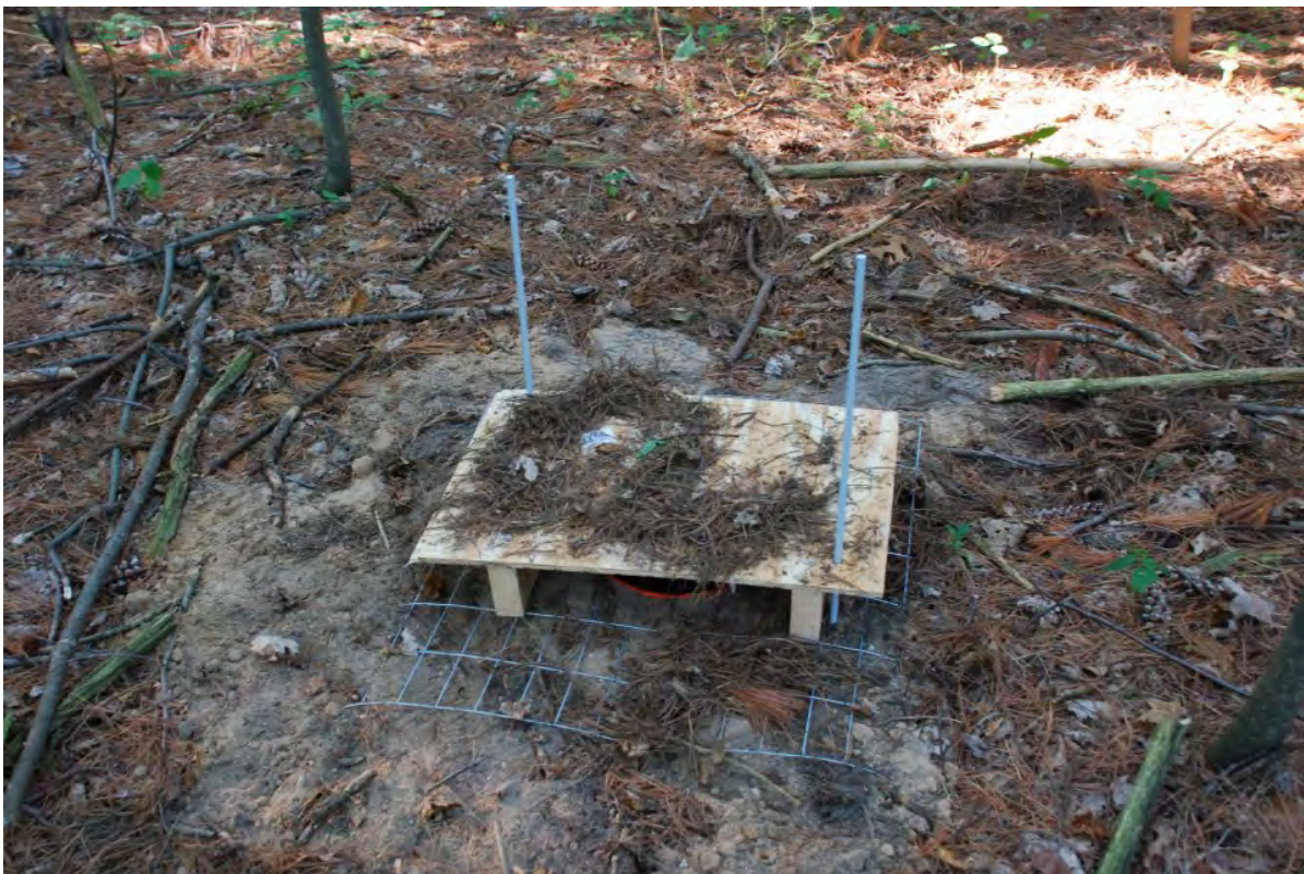
Figure 3. Baited pitfall trap showing animal enclosure (wire mesh), rain cover, and fiberglass anchors.